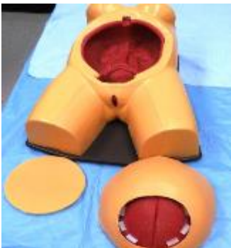
Image of Abdomen incision platform with insert