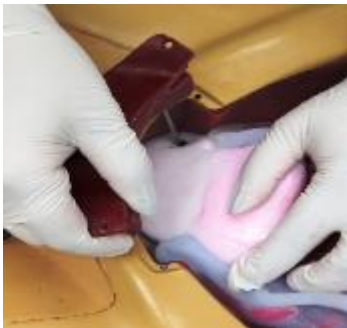
Insert uterine/pelvic lock and (2) screws (screws optional if using abdomen) DO NOT OVER TIGHTEN