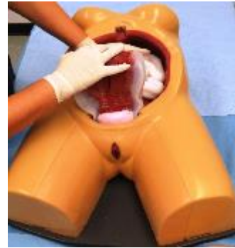
Place intestines behind uterus