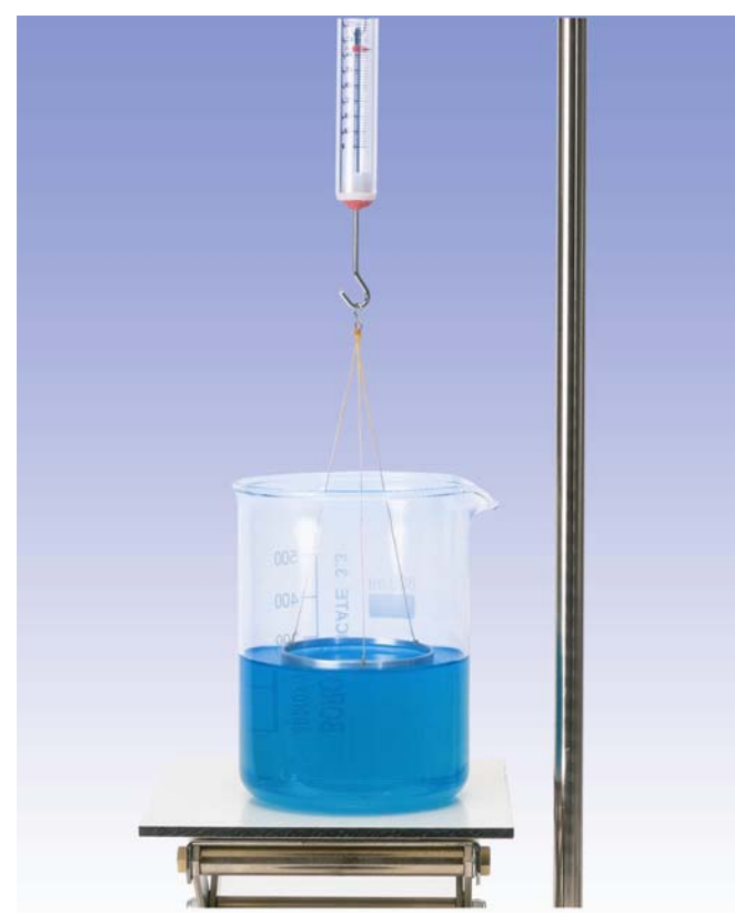
Fig. 3: Experiment set-up for surface tension measurements